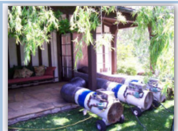
ECOLA Heat will effectively kill termites in a structure without the use of chemicals.

ECOLA has been protecting homes in your community since 1983. The stability of our company and experience of our inspectors will offer you peace of mind. We