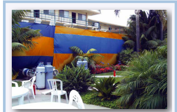
ECOLA Heat is being used in this 120 unit apartment complex. The tenants were not hassled with an overnight move-out.

There are only two recognized methods for full-structure eradication of Drywood Termites according to the California Department of Consumer Affairs - Fumigation and Heat - and ECOLA offers both of these. ECOLA Heat is clean, hot air blown into the infested area until the temperature inside reaches 140°F to 150°F and the temperature of the structural timbers is 120°F. This is usually accomplished within an 8 hour period which means no overnight move-out hassle, no bagging food, and no poisonous gas.